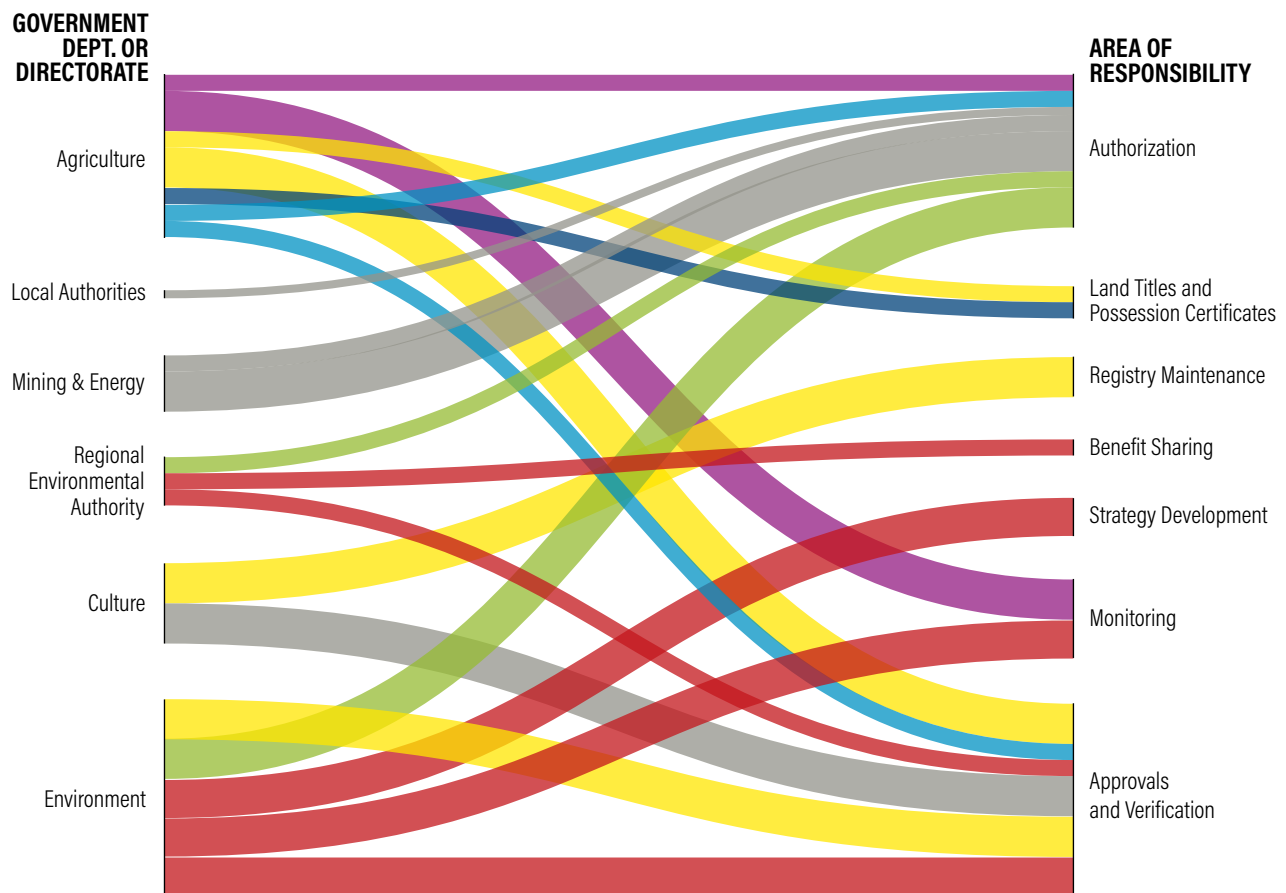
Figure 3 | Complexity of Governance in a Subnational Jurisdiction in Peru

At the local level, REDD+ projects initially created high expectations, especially related to the prospects of substantial cash transfers, which never happened due to lack of predictable finance (Angelsen and Vatn 2016). As these