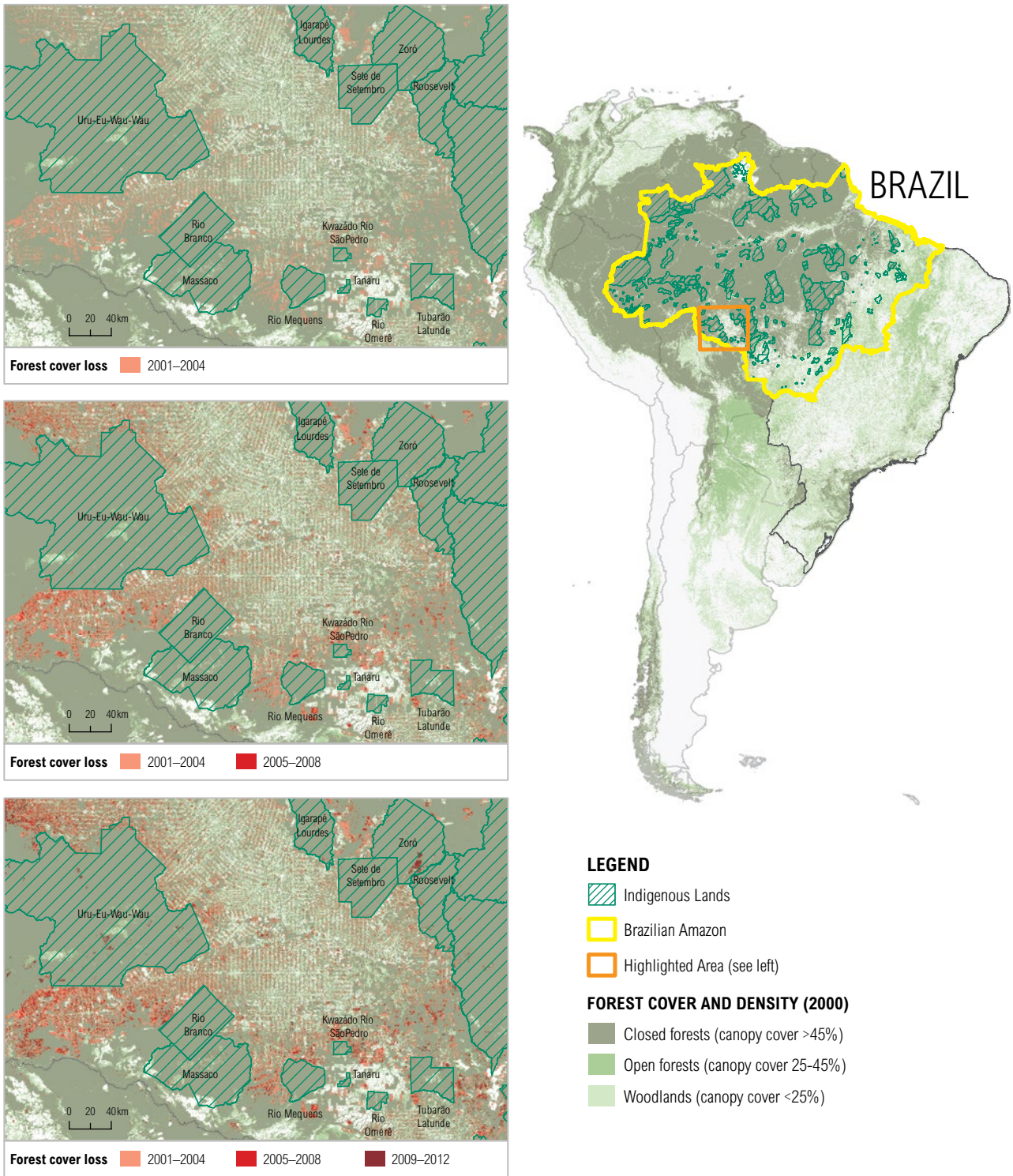
Figure 3 | Satellite-Detected Tree Cover Loss in Brazil, 2000–12, for Indigenous Lands in the Southwest of the Brazilian Amazon

Source: Forest cover loss data are from Hansen et al., 2013, and depict forest change at a spatial resolution of 30 meters across the globe. Data for Indigenous Lands are from the Ministry of Justice's National Indian Foundation (Fundação Nacional do Índio, 2013). The number of Indigenous Lands in the dataset is 371, which includes both fully recognized lands and those still in the registration process. NOTE: FUNAI's data on community lands show about 35 million fewer hectares than data from RRI. The reason for the discrepancy is FUNAI's data are for Indigenous Lands—not, as in the RRI data, for other tenure types: Extractive Reserves, Sustainable Development Reserves, Agro-Extractive Settlement Projects, Forest Settlement Projects, Sustainable Development Projects, and Quilombolas (peoples of African descent) Territories.